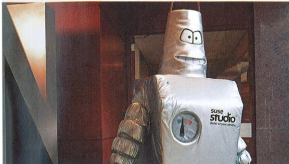
The Disters were named after the one-year-old SUSE Studio mascot